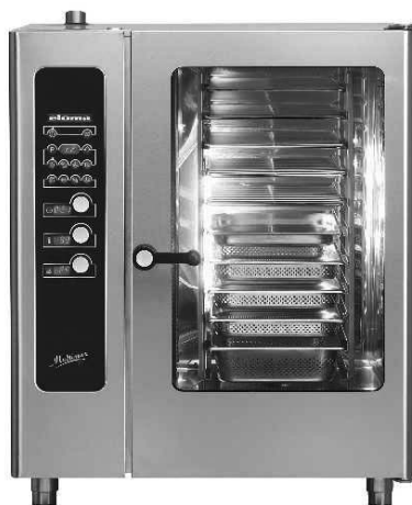
Multimax B 10-11